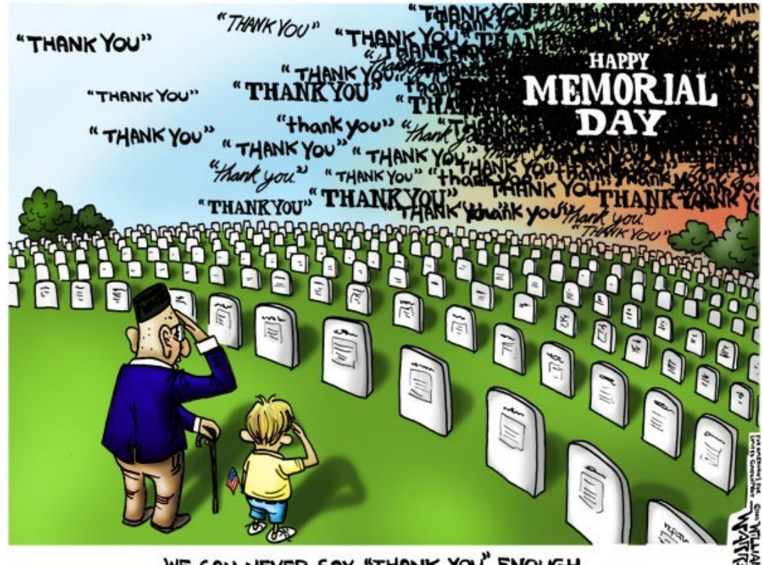
WE CAN NEVER SAY "THANK YOU" ENOUGH ...

and other publications published by the national organization. Additionally, the Digital Archive contains the ruling documents of The American Legion including current resolutions .